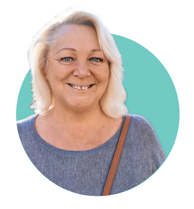
homelessness with the tools they needed to thrive in affordable and supportive housing.