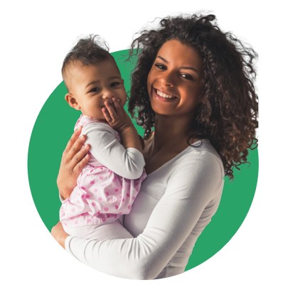
1,505 people accessed behavioral health services through treatment, tools, and a safe space to begin their journey to well-being.