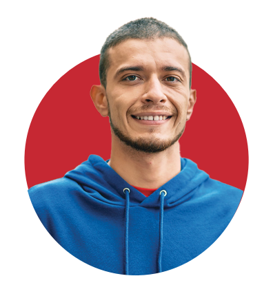
2,762 men and women returned home after incarceration receiving help with life-skills, counseling, employment, and housing.